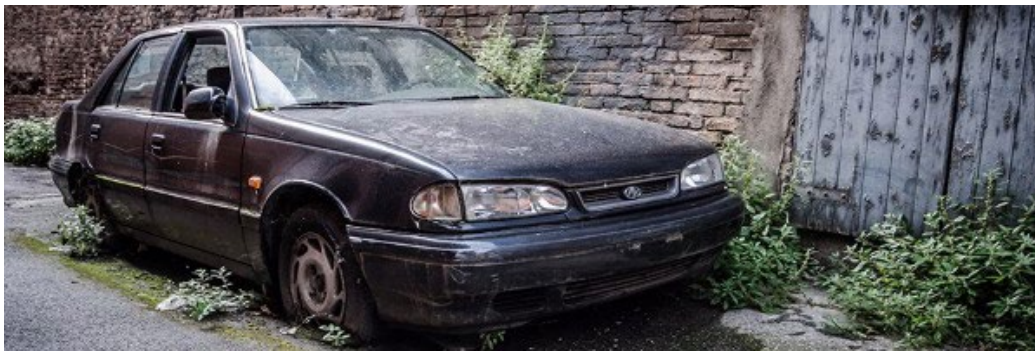
Image: Useless with style